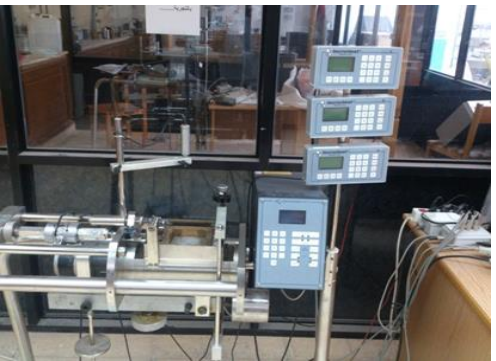
Figure1: tecnotest T 665/N Italy