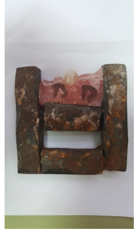
Figure 2:acrylic molds in the ironic box