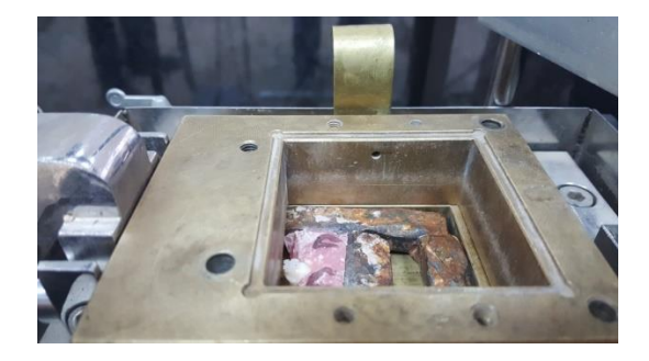
Figure 3:molds inside the machine