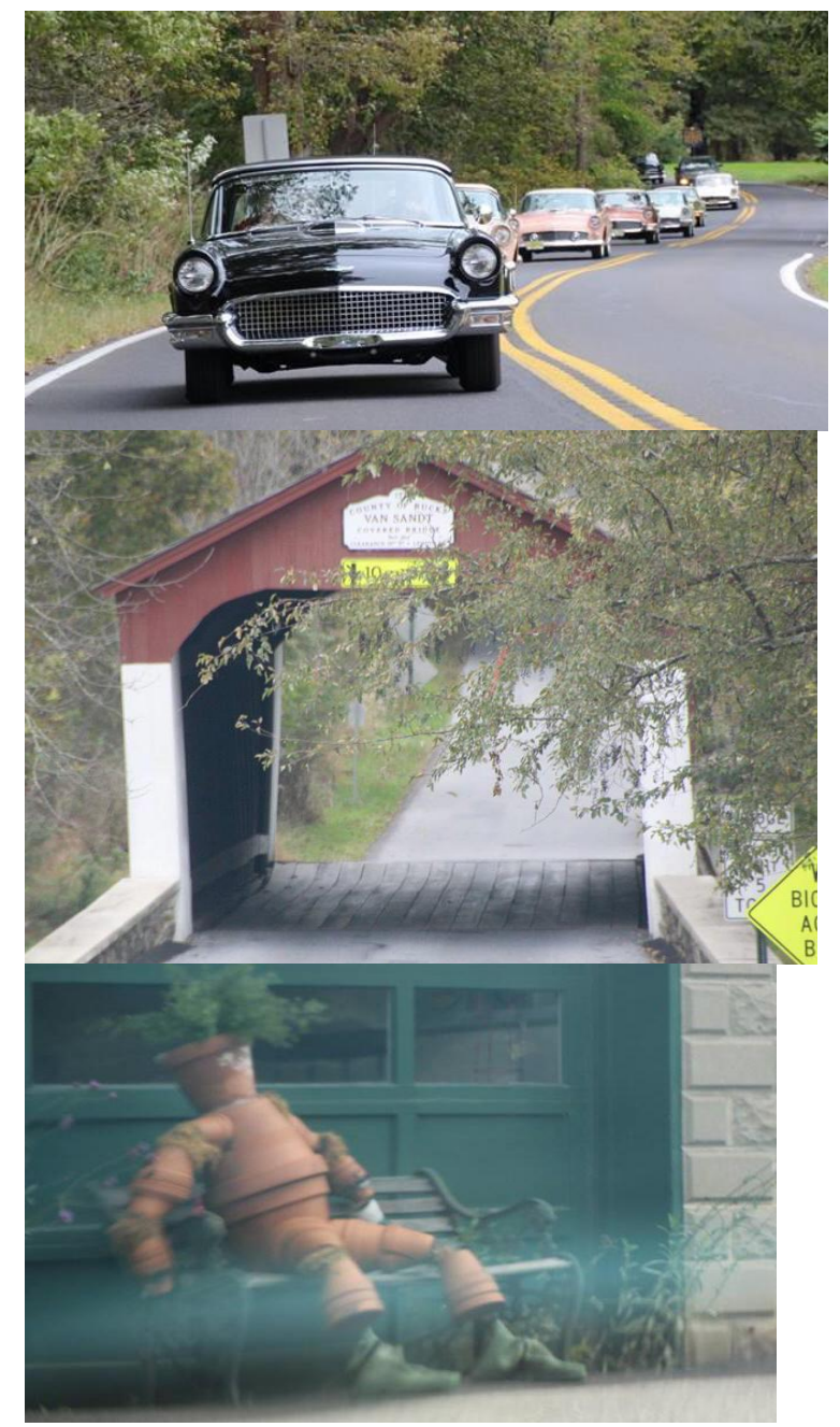
This guy really went to pot (Couldn't resist)