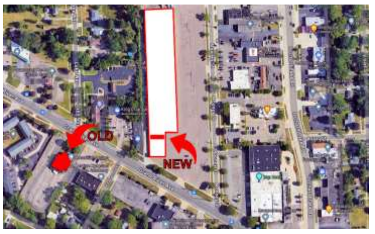
Google map view. Please zoom in for clarity.