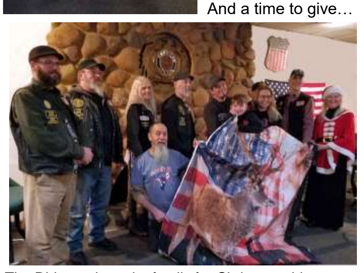
The Riders adopted a family for Christmas this year.