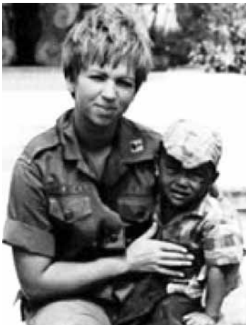
Army nurses in Vietnam cared for the civilian population as well as military.

Though relatively little official data exists about female Vietnam War veterans, the Vietnam Women's Memorial Foundation estimates that approximately 11,000 military women were stationed in Vietnam during the conflict. Nearly all of them were volunteers, and 90 percent served as military nurses, though women also worked as physicians, air traffic controllers, intelligence officers, clerks and other positions in the U.S. Women's Army Corps, U.S. Navy, Air Force and Marines and the Army Medical Specialist Corps. In addition to women in the armed forces, an unknown number of civilian women served in Vietnam on behalf of the Red Cross, United Service Organizations (USO), Catholic Relief Services and other humanitarian organizations, or as foreign correspondents for various news organizations.