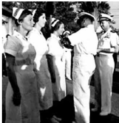
Navy nurses receive Purple Hearts after surviving a Viet Cong bombing of their living quarters. They were among 100 injured in the explosion, but immediately began treating other casualties, ignoring their own injuries.

Early on, the U.S. Army resisted sending women other than nurses to Vietnam. The Women's Army Corps (WAC), established during World War II, had a presence in Vietnam beginning in 1964, when General William Westmoreland asked the Pentagon to provide a WAC officer and non-commissioned officer to help the South Vietnamese train their own women's army corps. At its peak in 1970, WAC presence in Vietnam numbered some 20 officers and 130 enlisted women. WACs filled noncombat positions in U.S. Army headquarters in Saigon and other bases in South Vietnam; a number received decorations for meritorious service. No WACs died during the conflict.