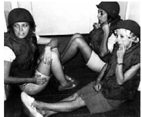
Air Force nurses wait out a rocket attack in the hallway of their quarters at Cam Ranh Bay in 1970.