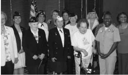
Unit 118 members enjoying the Rhode Island Military Woman of the Year banquet on 25 June.

Navy Supply Corps School in Newport. The banquet is one of our hallmark events and is looked forward to each year as a time to get together for a meal and enjoy each other's company.