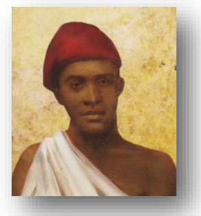
Feast Day: June 3

Readings for Pentecost Sunday, June 5, 2022 Acts 2:1:1-11 1 Corinthians 12:3-13 John 20:19-23