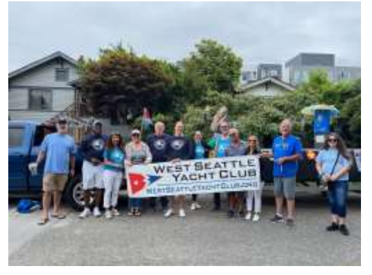
2022 West Seattle Grand Parade