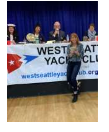
October Meeting Winners Birthdays and Some Great Food