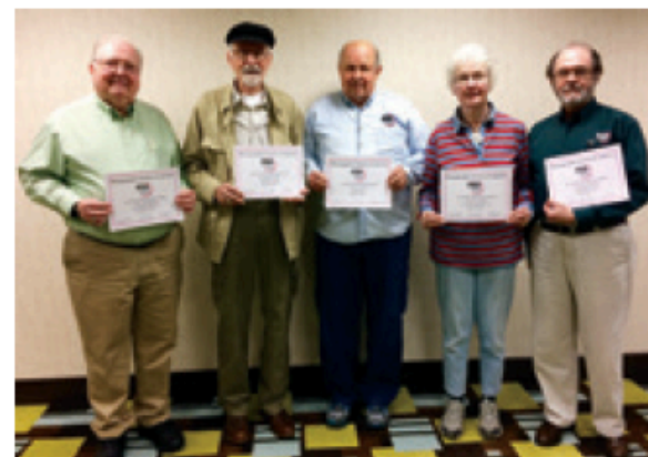
Portfolio Assessors Thank You Certificates.