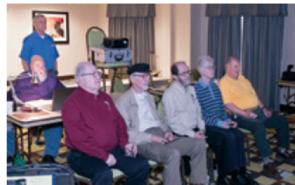
Digital Portfolio Assessment.