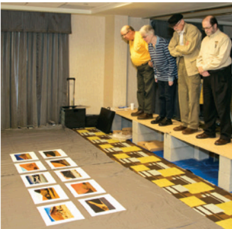
Print Portfolio Assessment.

• Images (digital or print): Each image should demonstrate variety and not be too similar to any other. Ten images are required for the first level (Bronze—BPSA), fifteen are required for the second level (Silver—SPSA), and twenty images are required for the third level (Gold—GPSA). Prints must be prepared by the entrant; commercially prepared prints are not eligible. The author's name may not appear anywhere on the projected image or print.