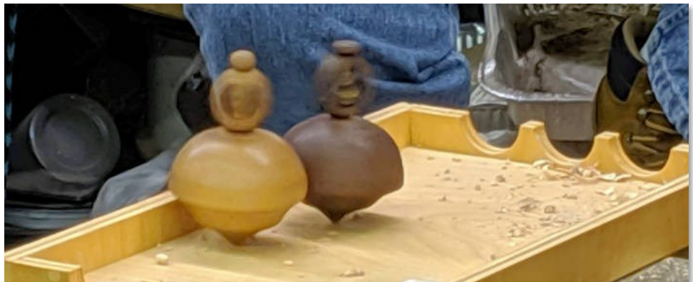
Pictured are two self winding tops made by Ian

Ian told us turning tops is a good exercise for beginning turners. He began with a piece of wood 2 - 2 1/2" in diameter and rounded it on the lathe between centers. To achieve this he used a 3/8" bowl gouge. He said that a 1/4" stem on a top is a good diameter for kids to grasp in turning it to spin. Also for kids, there should be no sharp edges.