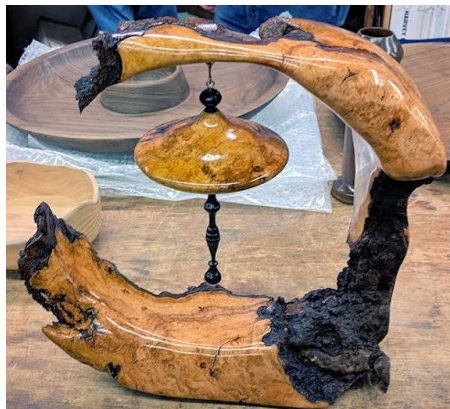
sculpture in maple burl by Kevin