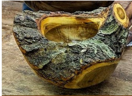
large natural edge bowl by Bill Dooley