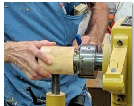
Ian mounts the blank for the top into the chuck.

by 3" in diameter. He rounded it and cut a tenon on each end and placed one end in a chuck with the topside of the top facing out. He then drilled a 1/4" hole in that end and turned it around on the lathe to turn and