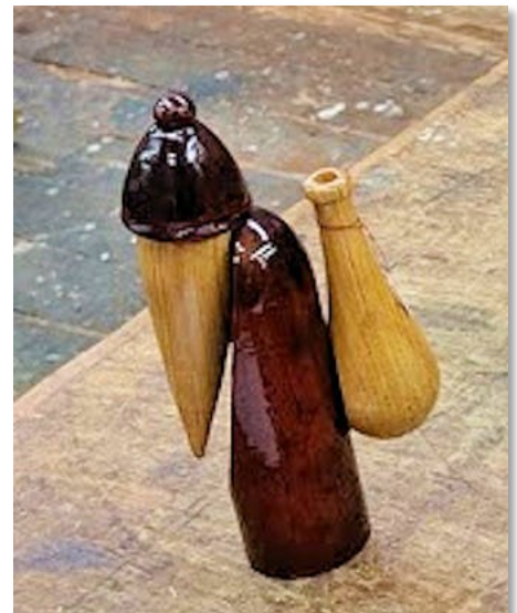
Sculpture of three combined shapes by Steve.