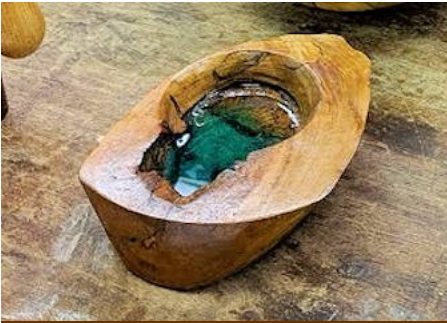
small vessel w epoxy dye by Bill Dooley