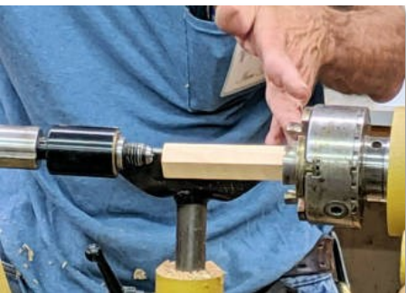
This photo shows the stem ready to be shaped on the lathe.