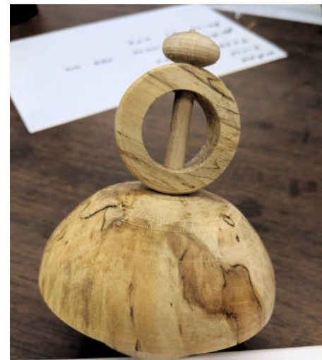
Ian's finished demo self winding top in spalted maple.