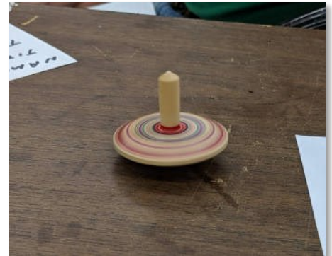
a spinning top decorated with colored markers like we turn and give away to kids at shows