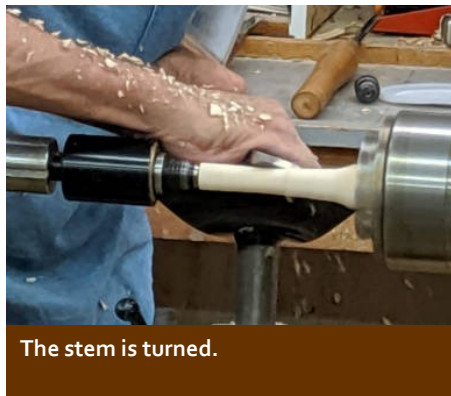
The stem is turned.