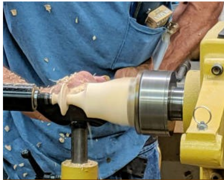
Close up of the top bottom being shaped