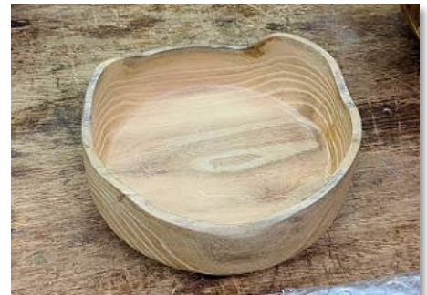
natural edge maple bowl by unknown member