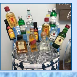
An assortment of alcoholic drinks in a polar bear lunch bag; great over ice!

Life-size polar bear cub, polar bear blanket, polar bear calendar, & scarf