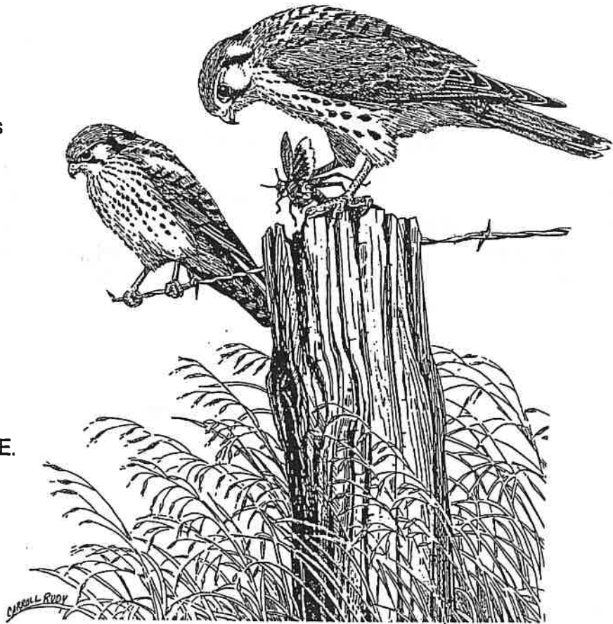
Young American Kestrels hunting socially after nest departure.

On all our field trips we bird around the meeting place for about 10 or so minutes, to allow for oversleepers. Then we mount up and head out.