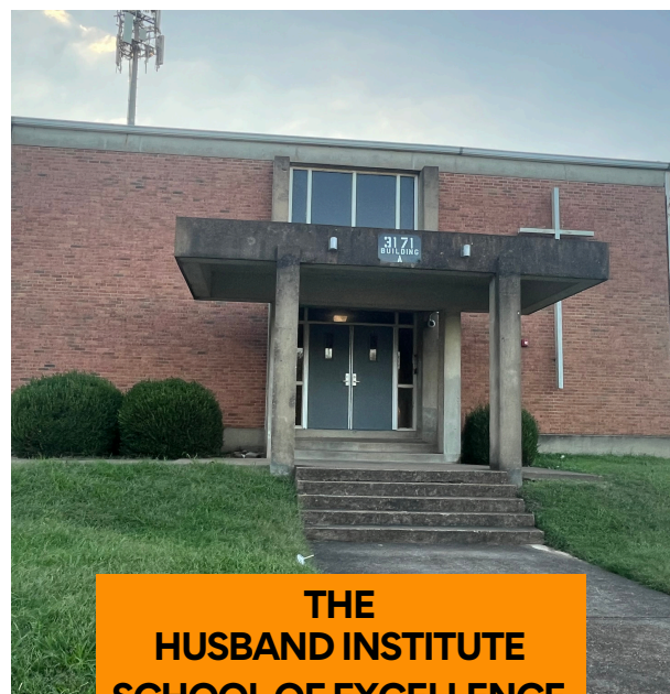
THE HUSBAND INSTITUTE SCHOOL OF EXCELLENCE

As part of our commitment to empowering young men, the Husbands Institute is excited to announce plans to reclaim and open an all-boys academy and school in Frayser. This institution will provide a nurturing and focused environment where male students can thrive academically and socially. Our vision is to create a space that emphasizes leadership, personal development, and community engagement, equipping students with the skills and values necessary to succeed in life. By fostering a culture of support and excellence, we aim to inspire the next generation of leaders and positive change-makers in our community.