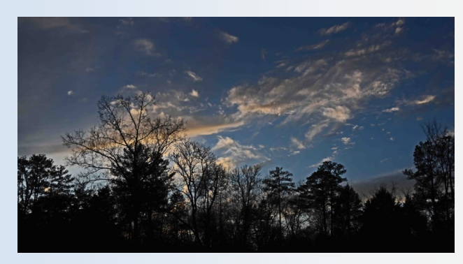
Clouds over Chichamauga battlefield close to Hag's Monument