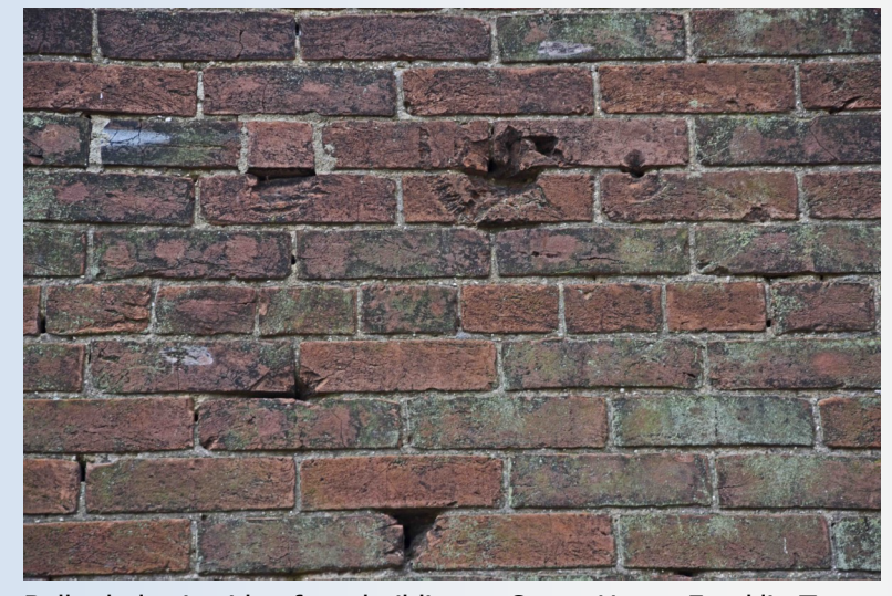
Bullet holes in side of out building at Carter House Franklin Tenn.