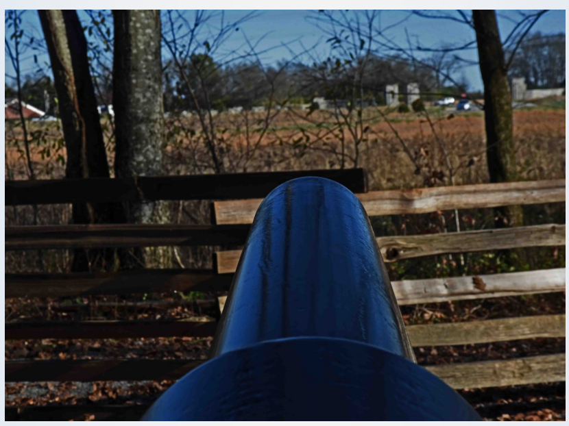
Looking down the tube of a Union gun. Confederates were advancing across the field in front. Stones River