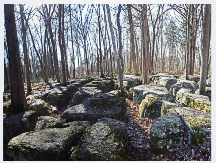
Built in foxholes at Stones River. A place called the Slaughter Pen. The rocks were split and had area in between so that the Union troops could fight from them and be somewhat protected.