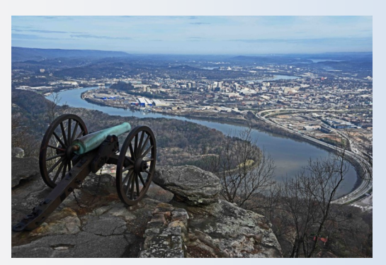
Overlook from top of Lookout Mountain