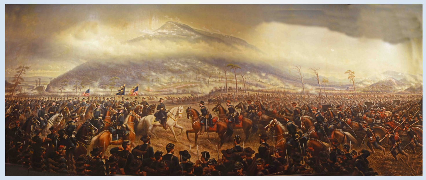
Hooker taking lookout Mt mural