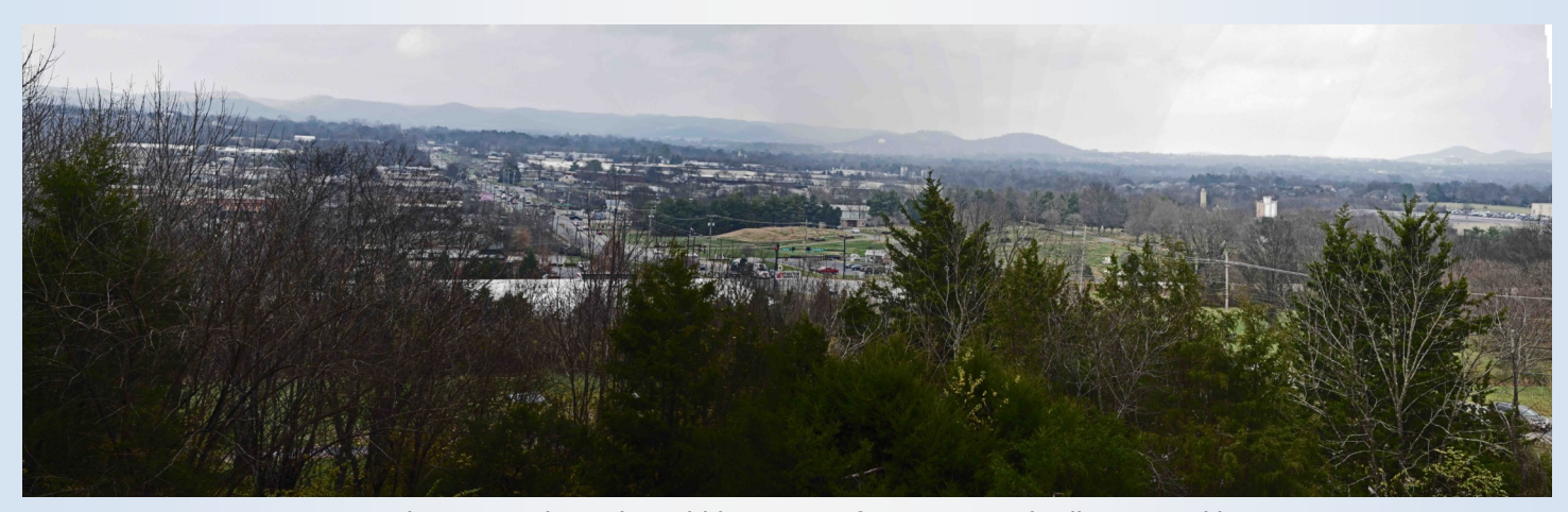
View that General Hood would have seen from Winstead Hill into Franklin