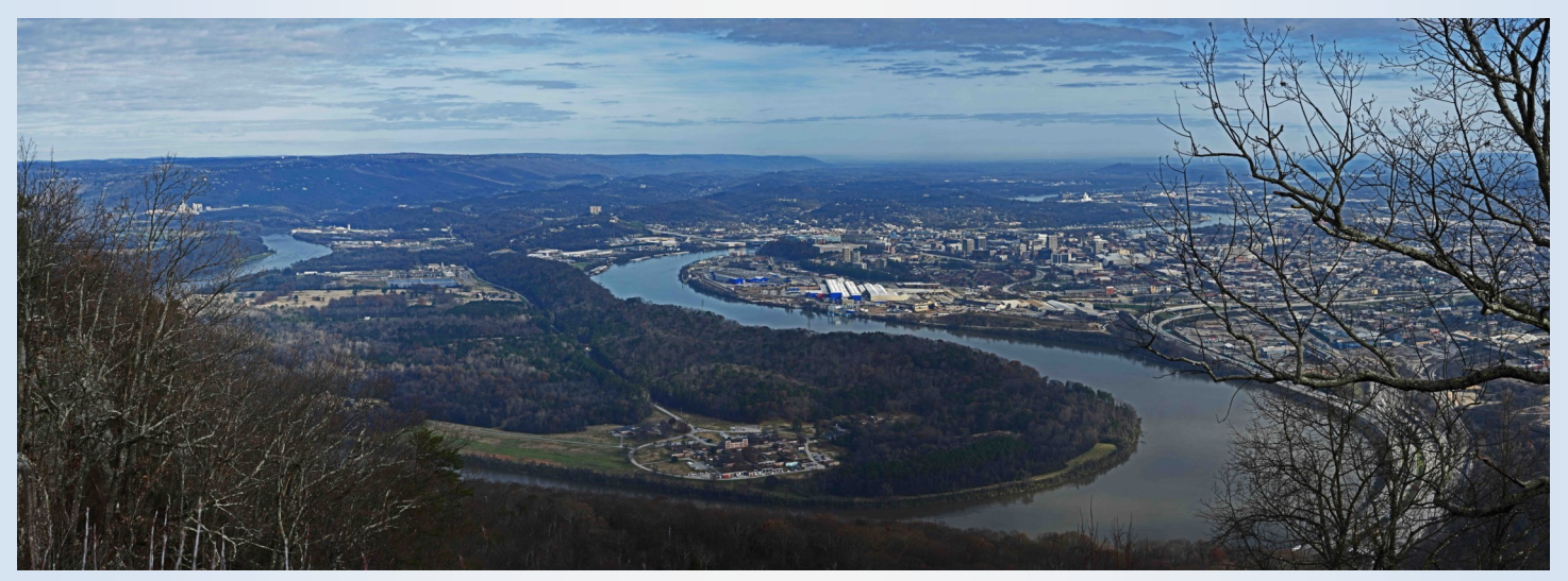
Tennessee River from Lookout MT