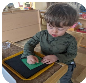
Shamrock Push Pin Work