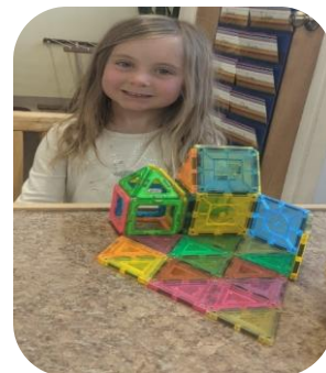
Constructing with Magnetic Shapes