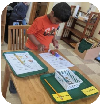
Magnetic vs Non-Magnetic