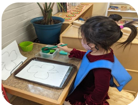
Shamrock Watercolor Painting