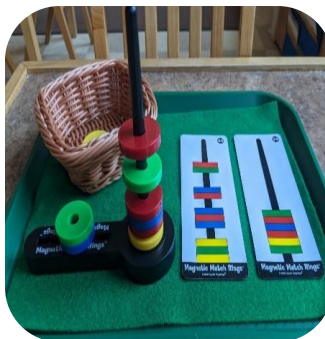
Exploring with Repelling & Attracting