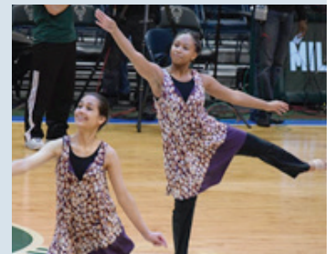
Our Level 6/7 ballet students were invited once again to dance at a Milwaukee Bucks game.