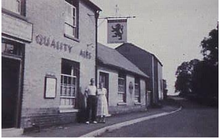
The Red Lion prior to 1962