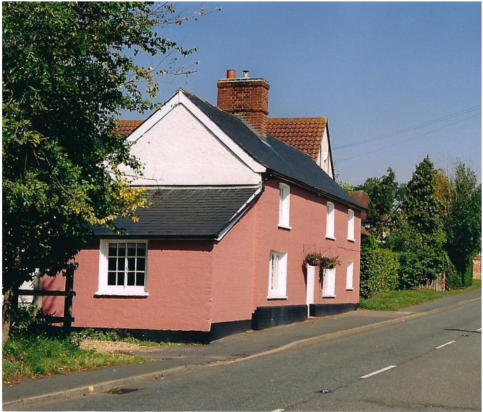
Residence in 2007, formerly the Black Bull