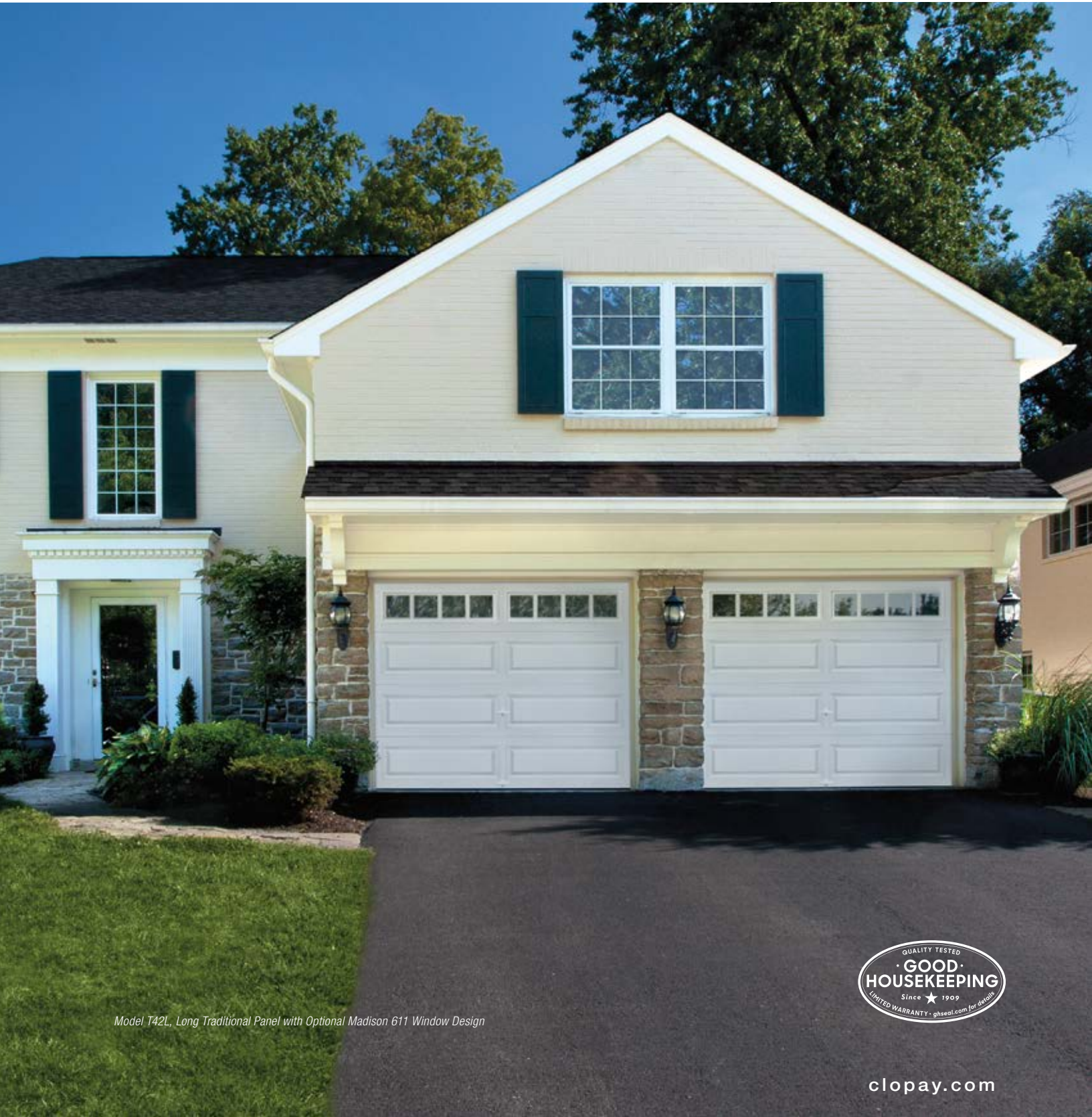
Model T42L, Long Traditional Panel with Optional Madison 611 Window Design