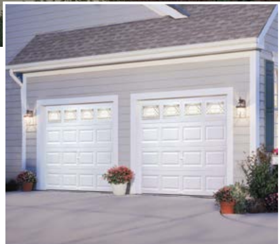
Model T41S, Short Traditional Panel with Optional Short Trillian Window Design