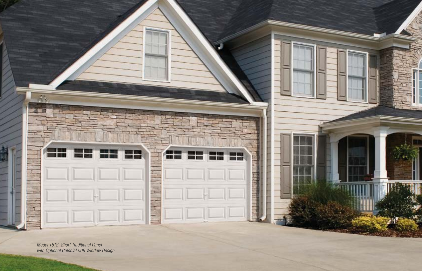
Model T51S, Short Traditional Panel with Optional Colonial 509 Window Design