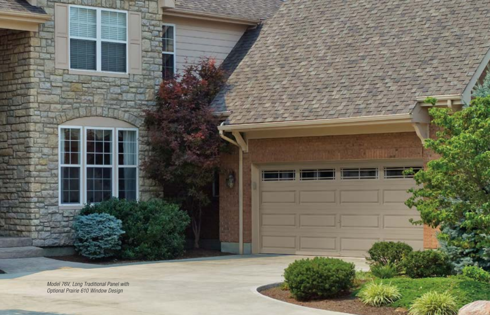
Model 76V, Long Traditional Panel with Optional Prairie 610 Window Design