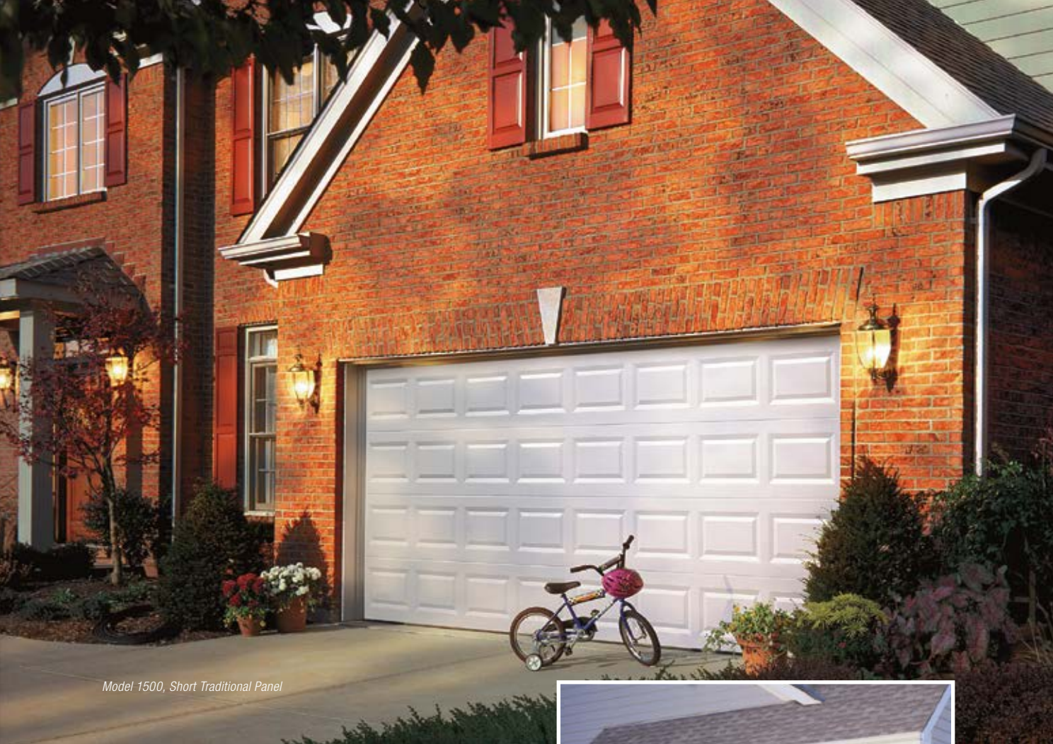
Model 1500, Short Traditional Panel