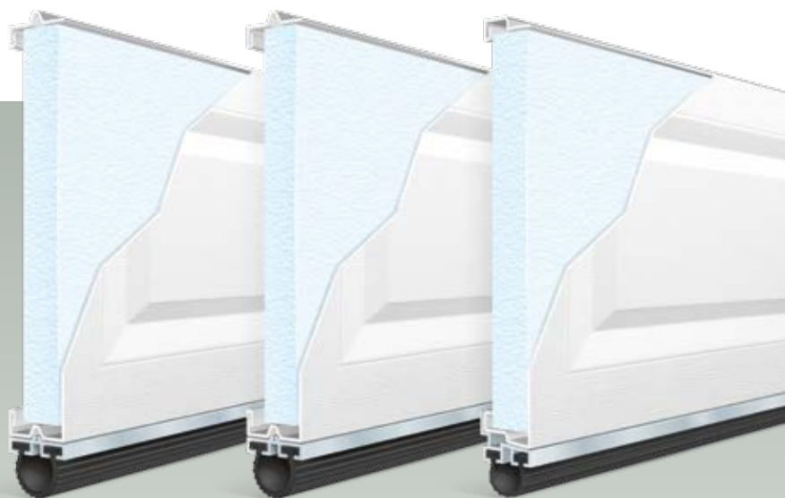
Tongue-and-Groove Section Joints