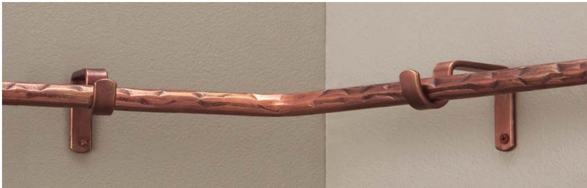
Shown: 120° soft bend bay corner for 75HSRB steel pole, L135 steel brackets, finish 730 Rose Gold