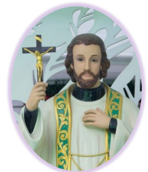
Feast Day: December 3

St. Francis Xavier was canonized in 1622 at the same ceremony as Ignatius of Loyola. He is the patron saint of Catholic missions, sailors, Japan and jewelers.