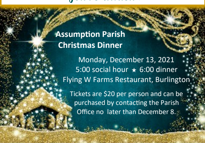
Dinner includes roast beef entrée and two sides, salad, rolls, dessert, iced tea, lemonade and coffee. Social hour is BYOB.