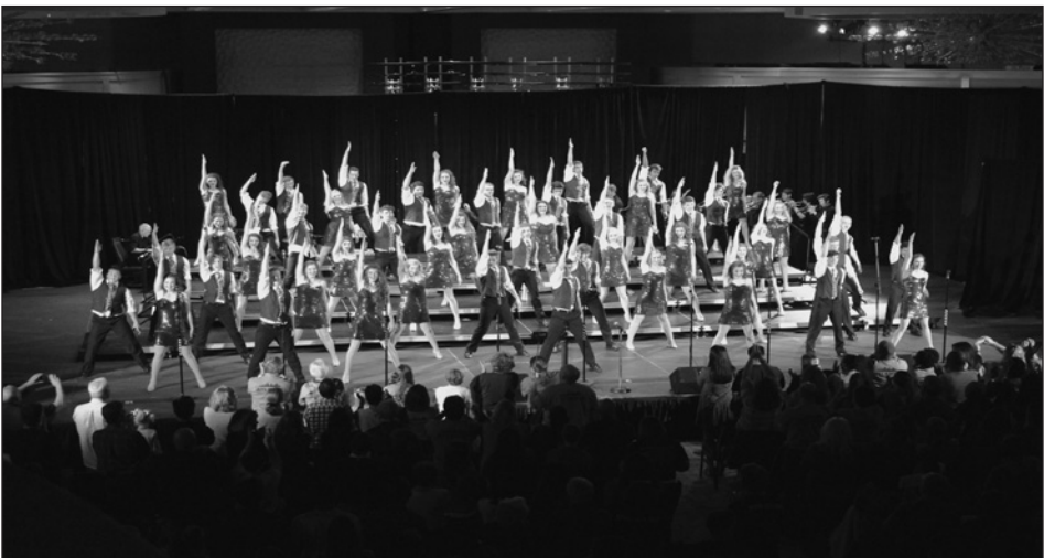
ATSC on stage at Heart of America in Atlanta.