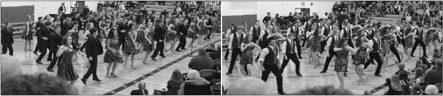
Westside Connection and the Amazing Technicolor Show Choir entertained the audience with selections from their shows.

Seed to Sow from page 1 ers performed three songs conducted by elementary music teachers sharing the duties. The eighth-grade chorus performed a few pieces and then split into men’s and women’s choruses with the Warrior Choir.