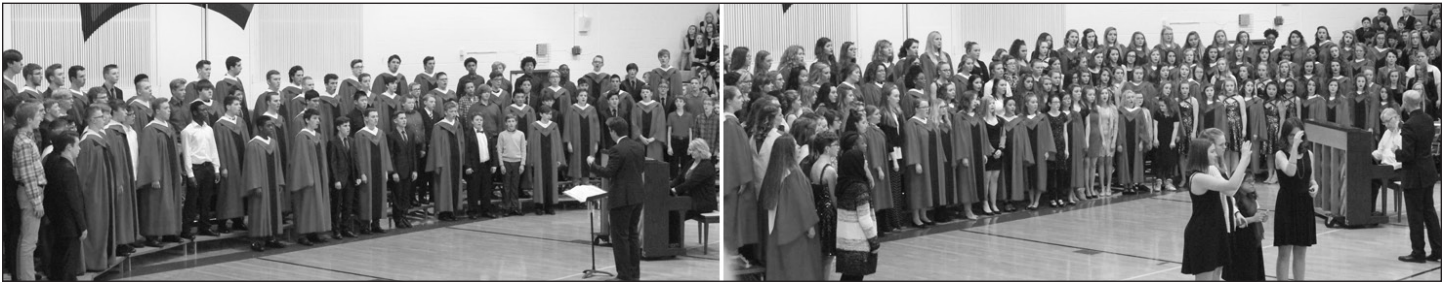
Eighth-grade boys joined the Warrior Choir men, and eighth-grade girls joined the Warrior Choir women, to perform a song.