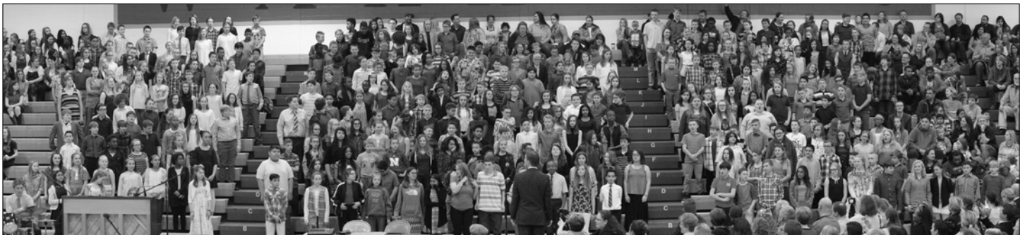
469 sixth-grade students representing all Westside elementary schools performed during the Winter Choral Festival.

During the concert, the sixth-grade Seed to Sow to page 5