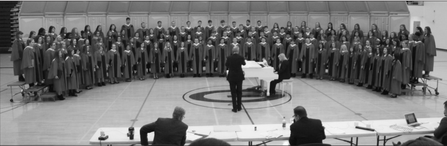
Westside's Warrior Choir performing at the District Choral Competition, where group received a 1+, the highest rating possible at the competition.

Westside's Warrior Choir earned the highest rating possible at the District Music Contest April 20-22.