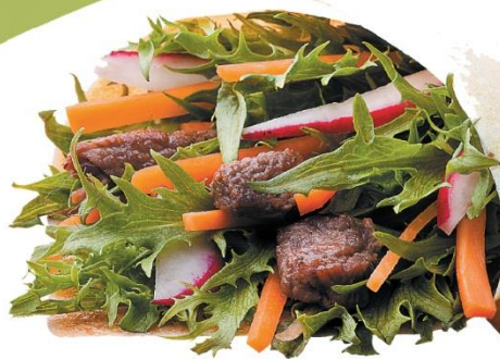
Pictured: Original version above Curry Version right