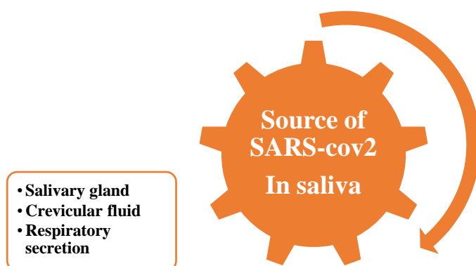
Fig1) Suggested source of SARS-CoV2 in saliva.