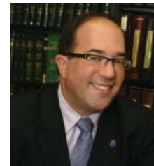
Jack Warner Commissioner Rhode Island Board of Governors for Higher Education