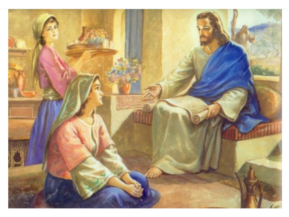
Scriptures for Reflection Luke 10:38-42 & John 11:1-145