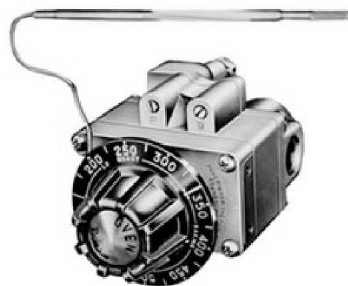
4200-002, 007, 018, 025, 503