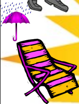
Bring a Lawn Chair