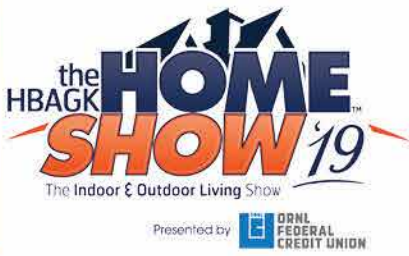
Exhibit Space Reservation Form

Please return completed application with payment to: