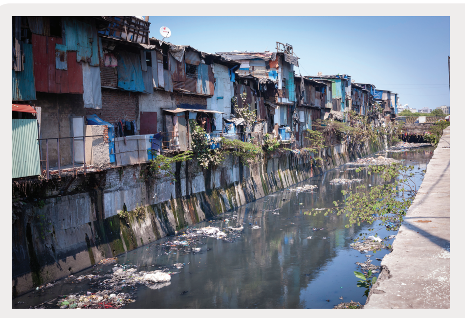
Figure 4 Part of Dharavi, Mumbai

deal of discrimination still remains. This affects access to jobs and higher wages that can lift the poorest members of Indian society out of poverty.