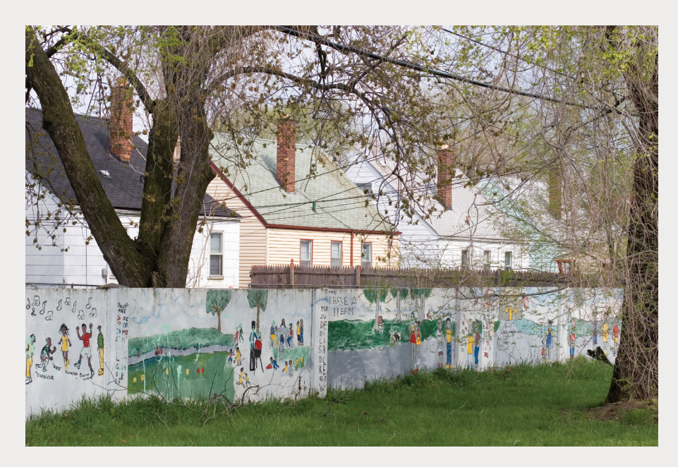
Figure 1 Detroit's Segregation Wall

Many suburbs aggressively prevented black families from