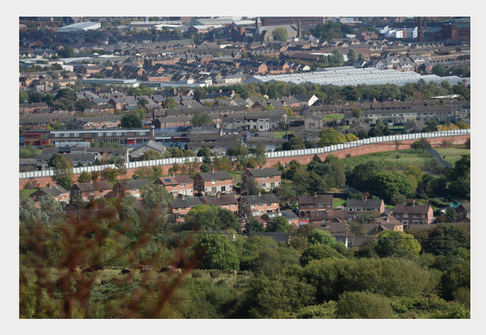
Figure 5 Peace line and wall in Belfast

Some recent research identified four main factors behind the rise