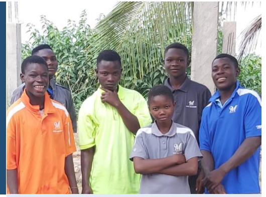
Kids in Ghana strike a pose in their new shirts!

The Salvatorian Mission Warehouse continued to provide relief to those most in need even as the pandemic raged in 2020.