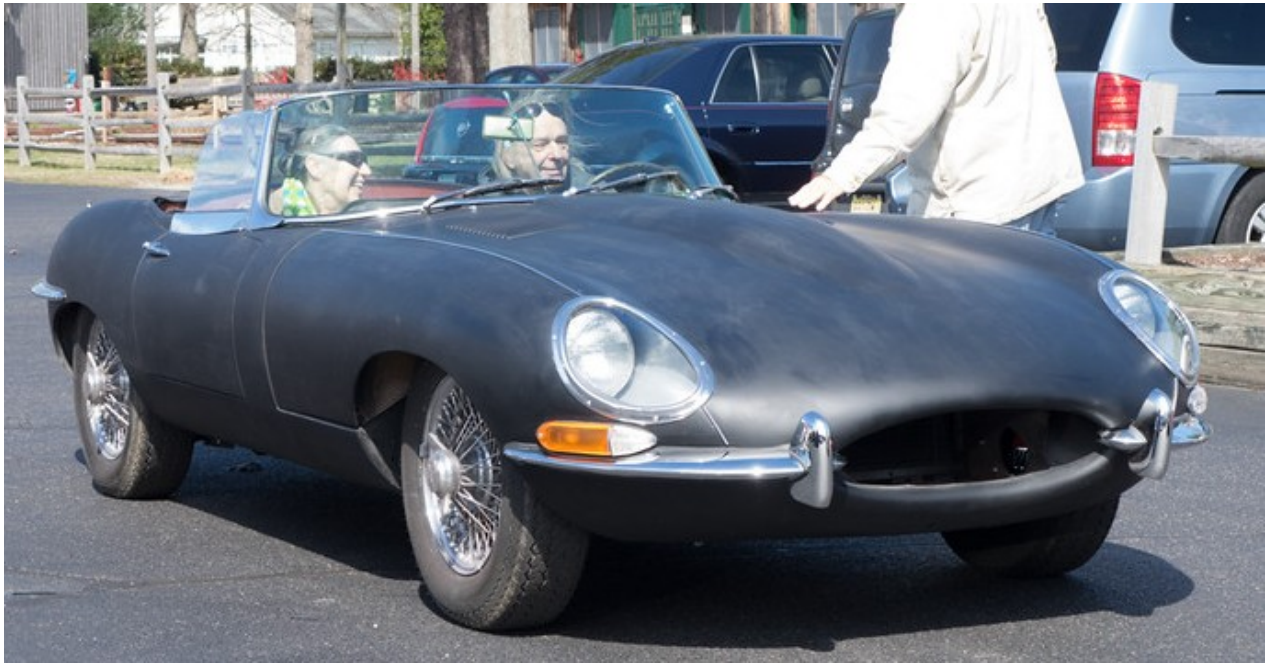
Eddie's Restorations "LEAD SLED" '63 Jaguar E-type