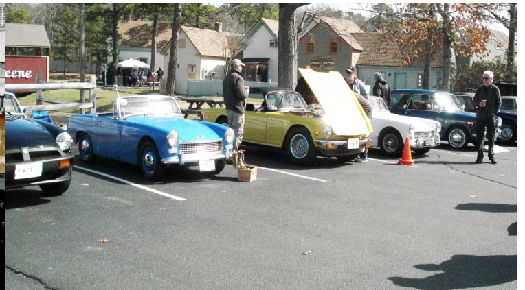
Smithville Show (above and below)