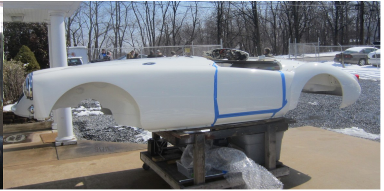
BMC member Mel Baida's '58 MGA undergoing body off restoration @ Motorcar Garage

Getting an aging British car ready for a driving season of safe, trouble free operation was discussed in detail. Safety essentials: 1.) brakes 2.) fuel system 3.) steering 4.) suspension 5.) exterior lighting. Tire safety was briefly discussed but due to no expert consensus of what is a safe tire, it was left to each person to make their own judgment. Reliability essentials: 1.) charging system 2.) clutch, trans. & driveline 3.) starter 4.) ignition 5.) wheel bearings.