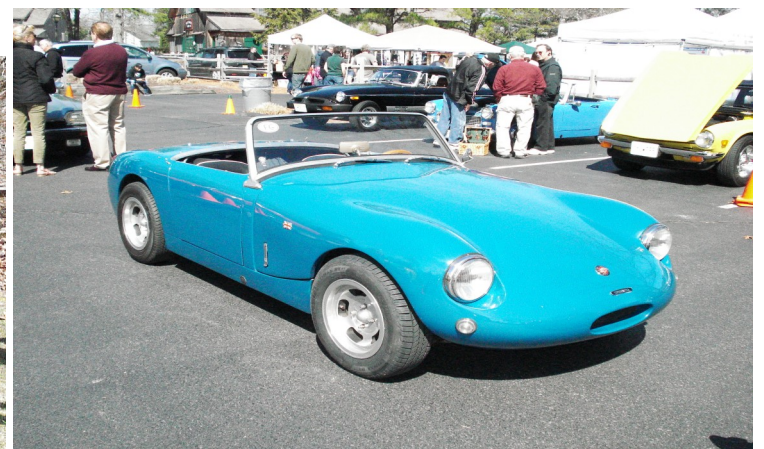
Speedwell nosed A-H Sprite