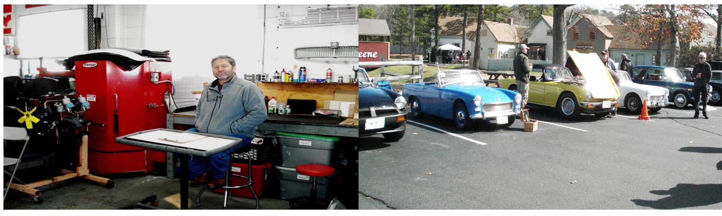
Pete Cosmides' Motorcar Garage TECH. SESSION re: Safety & Reliabilty Inspections