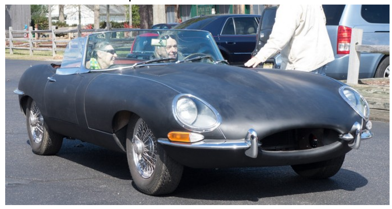
Eddie's Restorations "LEAD SLED" '63 Jaguar E-type