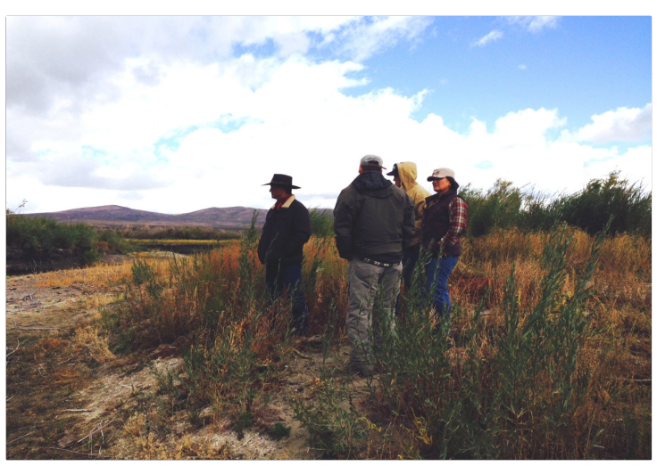
Tour participants view a project site along the Humboldt River.

The first stop of the tour was a ranch just east of Elko. HWCWMA's work there included willow-slippings along a highly eroded portion of the River. The willows were used in an attempt to establish root mass that will be essential to securing critical points along the river banks to compete with noxious weeds, improve water quality by reducing erosion, and to protect diversion structures from washing out in high flow events. Controlling perennial pepperweed and other invasive species, the very root of the erosion problem will be key to continued recovery at the project site.