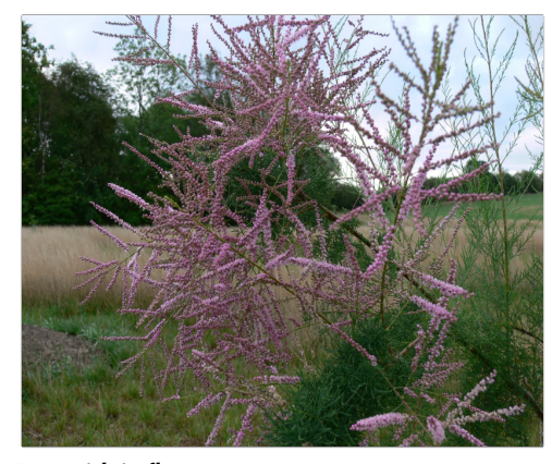
Tamarisk in flower stage.

Most commonly, patches of Tamarisk are cut close to the ground using chainsaws, the stumps are then treated with the systemic herbicide triclopyr. The herbicide must be applied to the stumps within approximately 15 minutes of cutting. Smaller plants can be controlled by spraying the foliage during periods when the plant is not in dormancy.