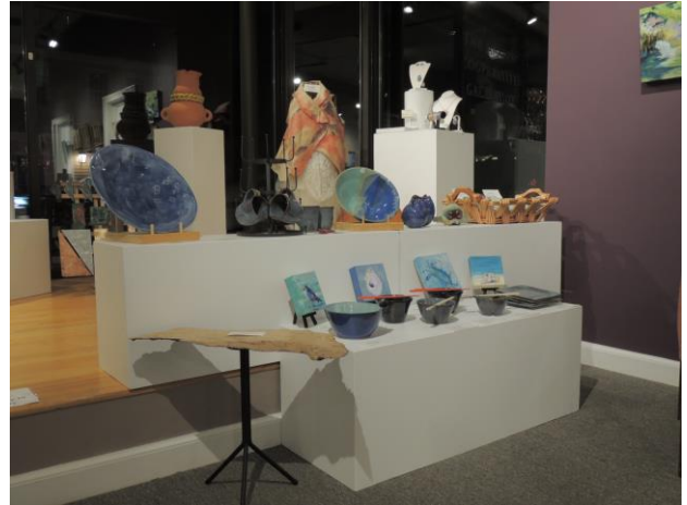
Check out the newly painted cubes and baseboard