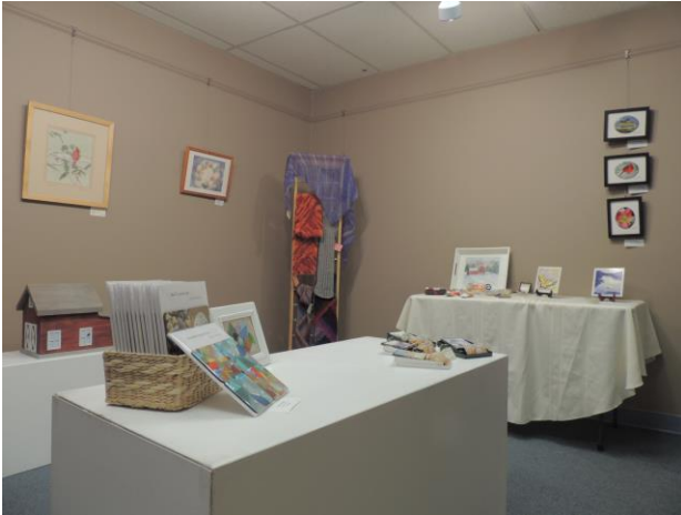
Freshly painted cubes look great and gives artwork a more professional-looking display surface