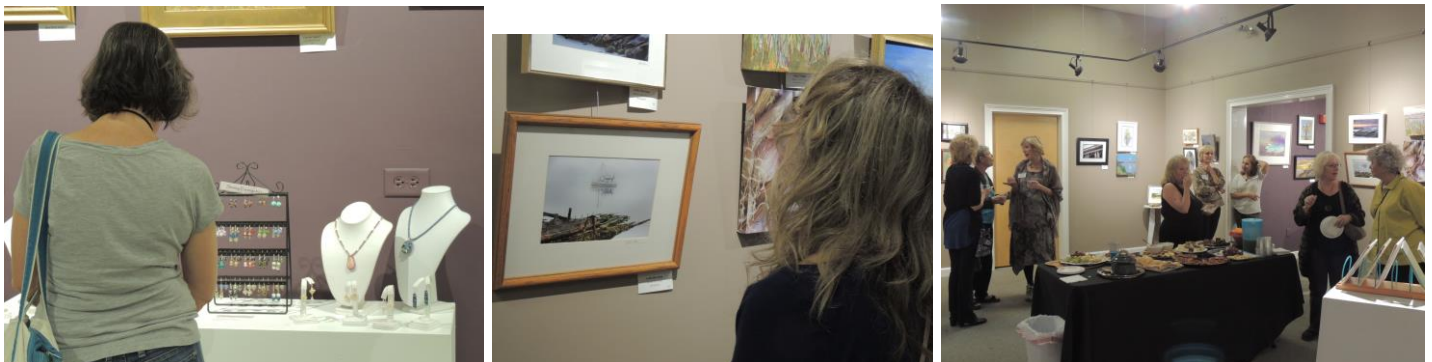
The fine jewelry, paintings, and photographs were enjoyed by members and guests