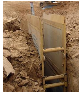
This trench box saved an employee's life when the dirt walls around him collapsed.

OSHA's Agency Priority Goal for 2018 aims to reduce trenching and excavation hazards. According to the Bureau of Labor Statistics, excavation and trench-related fatalities in 2016 were nearly double the average of the previous five years. OSHA's goal is to increase awareness of trenching hazards in construction, educate employers and workers on safe cave-in prevention solutions, and decrease the number of trench collapses. OSHA plans to issue public service announcements, support the National Utility Contractors Association's 2018 Trench Safety Stand Down , update online resources on trench safety, and work