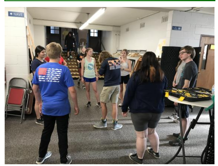
Wallace Students Mission Trip

SonShine Choir! Our rehearsal for this month will be on May 17 @ 5:30 in the choir room upstairs! This will be our last rehearsal until September.