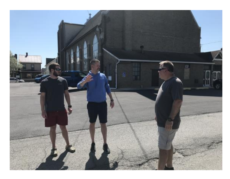
Wallace Students Mission Trip

Q: What did the digital clock say to its mother? A: "Look, Ma! No hands!"