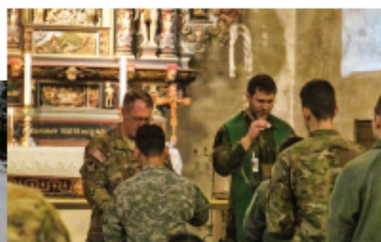
Communion at Værnes Church