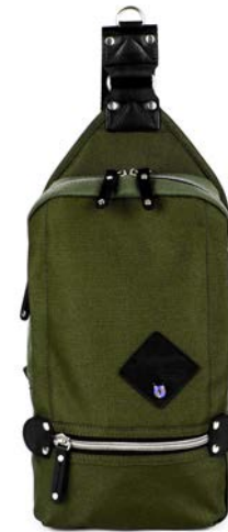
Army Green (Dark Green/Light Green)