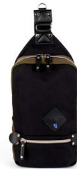
Black (Black/Dark Green)

The popular Sling Pack is reconstructed with the new color palette designs taken after the colors from military uniforms and jackets. Perfect bag to carry and manage your daily essentials effortless with quick access to your gear. Plenty of organization for your essentials, makes this a solid companion for your commute and adventures around the city.