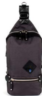
Gun Metal (Dark Grey/Black)