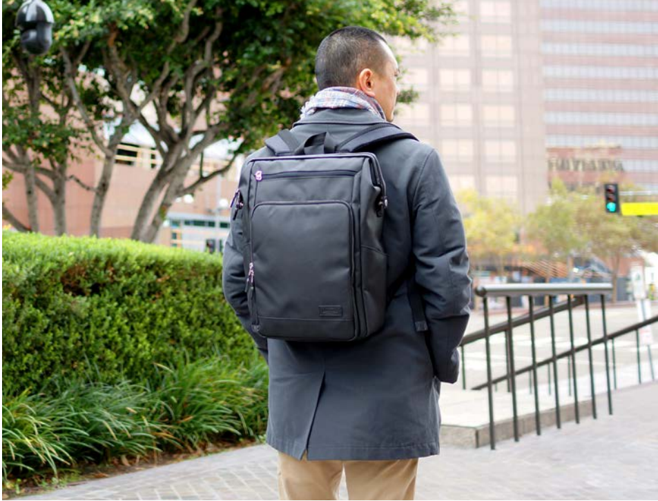
GABA CITY BACKPACK