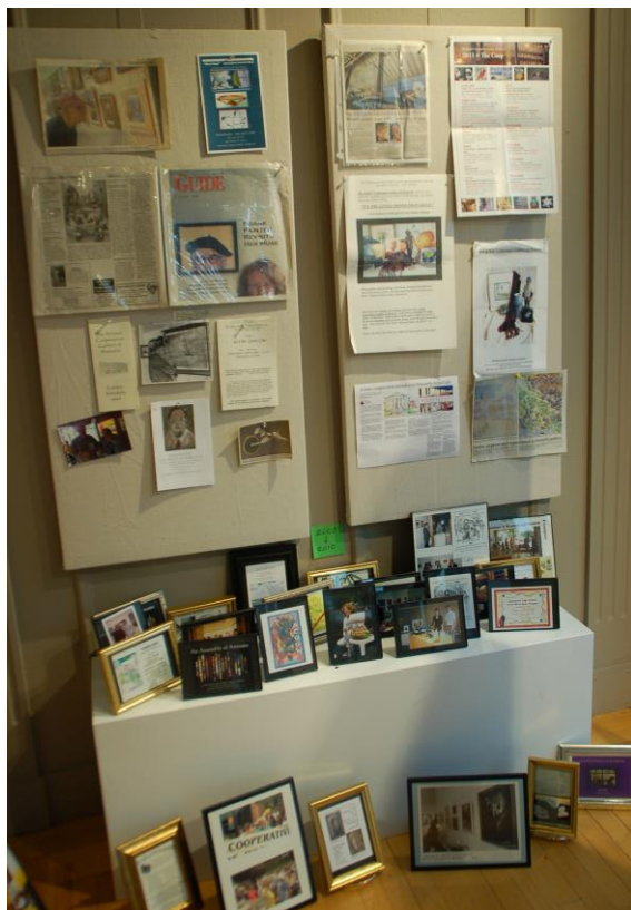
Photos, newspaper articles, posters enable visitors to explore our past