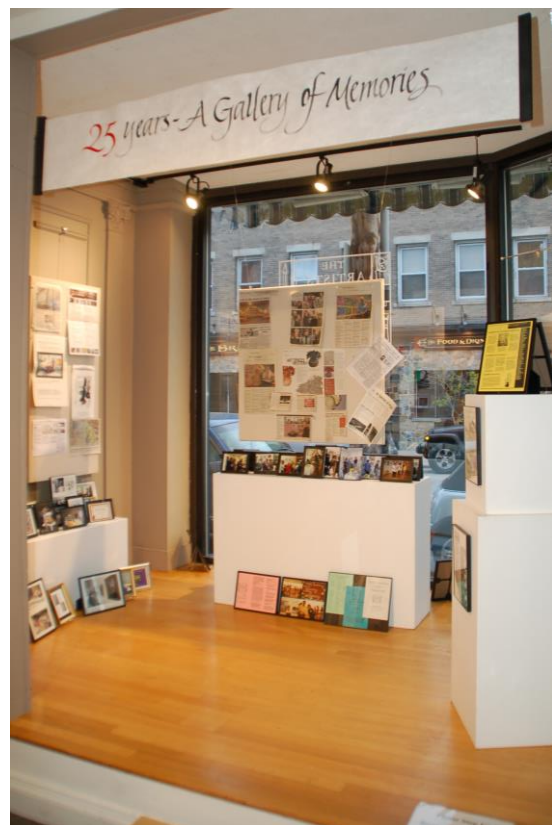
Jane Rollins' signs and a digital photo frame of recent memories are invitations to see history