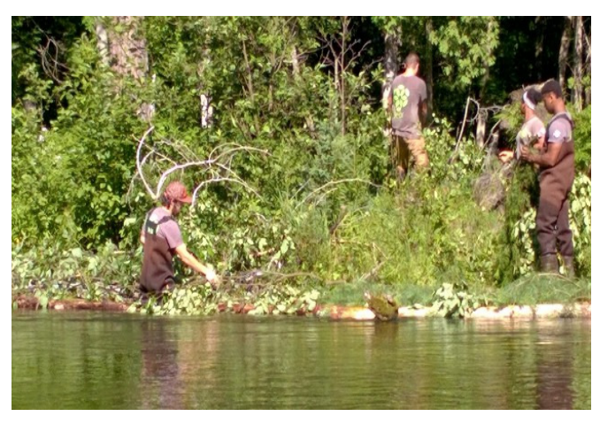
North Branch Project