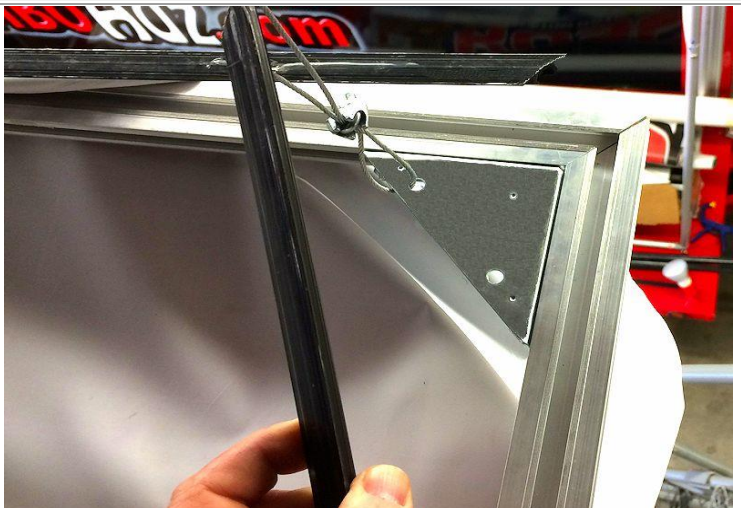
Detail of a suspended panel. Notice the steel cable attached to a 4" reinforced corner brace.