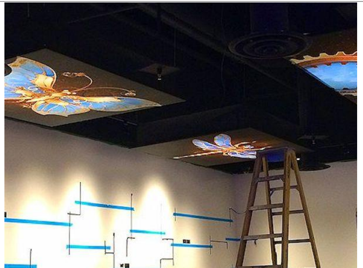
Another photo taken during the installation of the retro lighted TS32 panels...