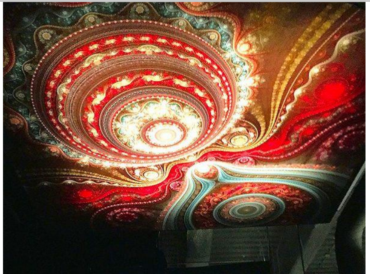
Details of one of the panels during the installation.