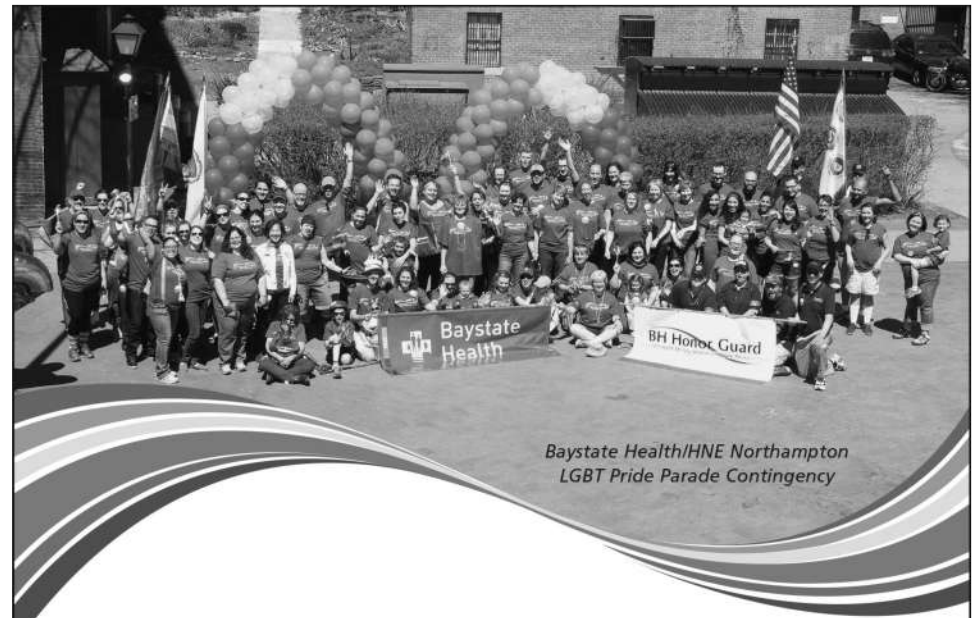
Baystate Health/HNE Northampton LGBT Pride Parade Contingency

Visit www.NohoPride.org/sponsor for details