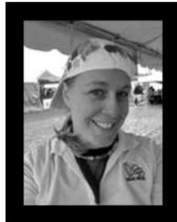
Content Manager Youth Tent Coordinator