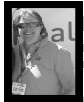
Operations Manager Parade Coordinator