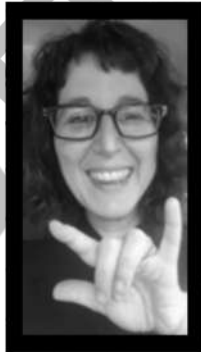
ASL Interpreter Coordinator