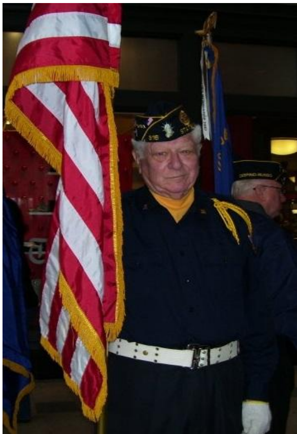
Rest in Peace!