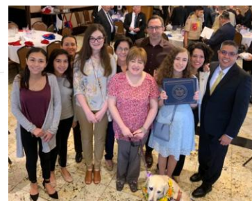
Present at the ceremony was Congressman Max Rose