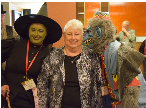
I think that monkey needs a tic tac