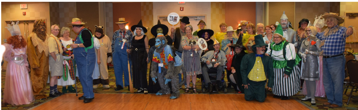
Official cast of the Yellow Brick Road costume party