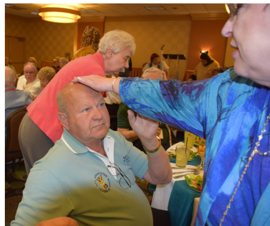
Rubbing Butch's head for good luck.