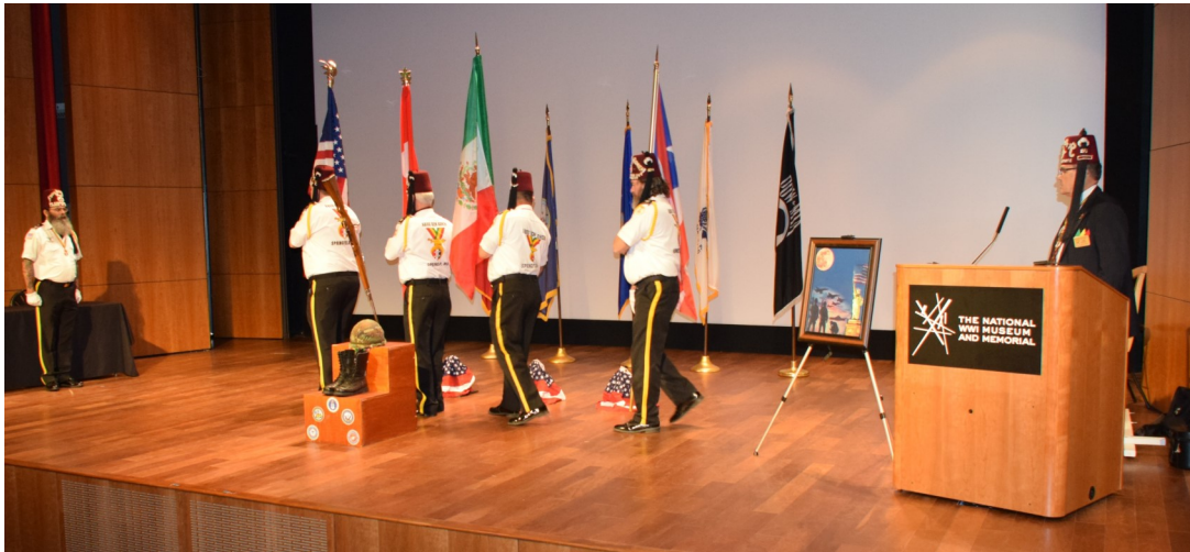
Abou Ben Adhem Legion of Honor doing Color Guard at the Necrology at WWI Museum