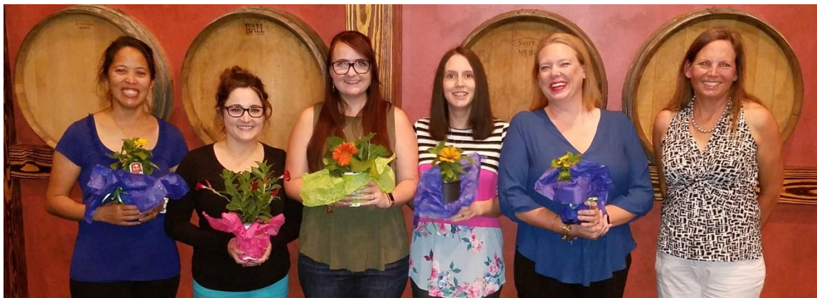
2018-2019 Executive Board (minus our Secretary)

Positions highlighted in yellow denote open positions