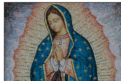
Feast Day: December 12