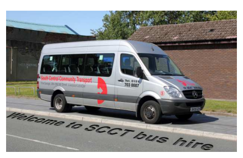
One of SCCT's excellent buses