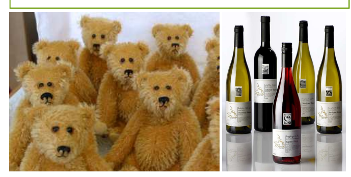
LARGE TEDDIES AND WINE WANTED!

Your help and support would be greatly appreciated