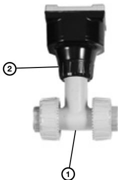
Figure 3 – Flow Meters for Permanent Installation