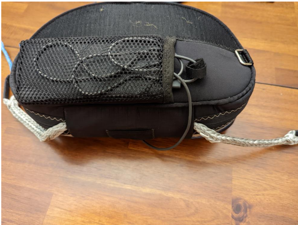
the battery and place the excess cable inside the pocket.