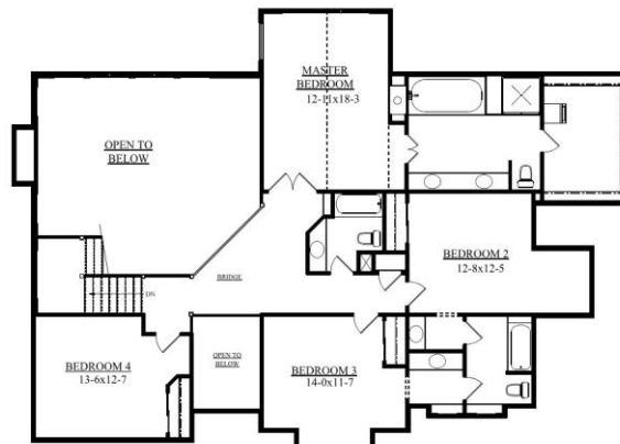
UPPER FLOOR PLAN 1638 FinSqFt