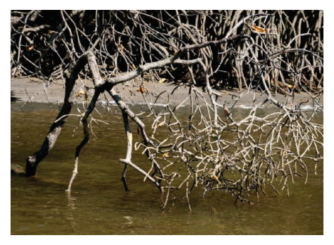
Mangrove loss. Brazil's Forest Act threatens coastal wetlands.